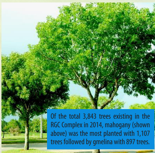
Of the total 3,843 trees existing in the RGC Complex in 2014, mahogany (shown above) was the most planted with 1,107 trees followed by gmelina with 897 trees.

For the RGC and the RDC2 as well, the study is a first step in identifying measures to reduce GHG emissions and ultimately mitigate the impacts of global warming and climate change. | NEDA DRD.