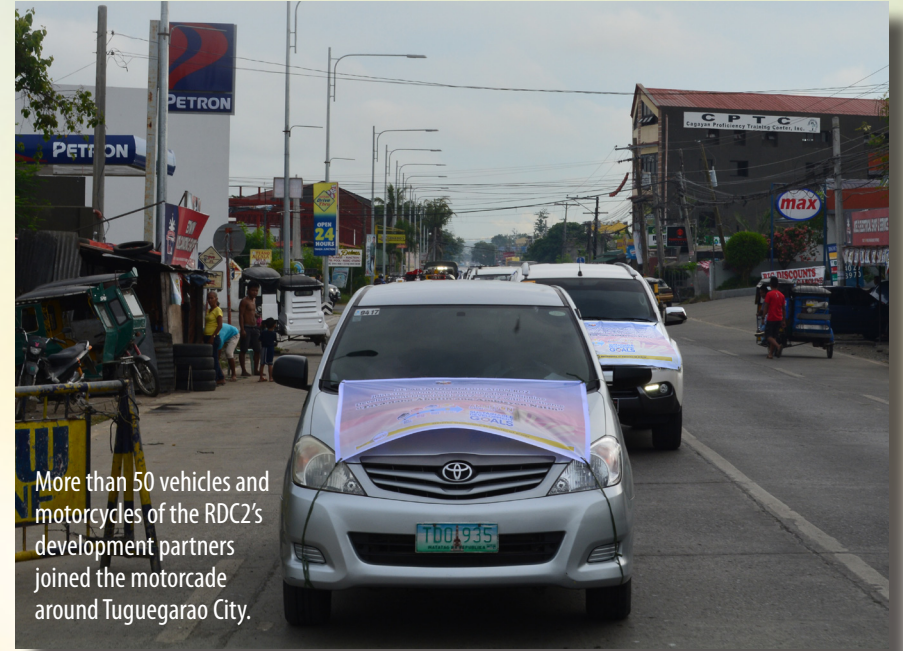
More than 50 vehicles and motorcycles of the RDC2's development partners joined the motorcade around Tuguegarao City.

"The PDP and the RDP both etch concrete strategies, policy